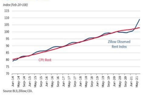
Figure 2. Rental prices

However, you do not "consume" housing if you own a house, but rather you invest in it. So, economists came up with the term Owner Equivalent Rent (OER) that supposedly represents that segment. Basically, they do a phone survey and ask owners how much they would charge someone to rent their house if they didn't live in it. That's obviously pretty subjective, and likely inaccurate (the latest data point was up only 2.5%). Stand alone rent also seems to be measured unreliably. In the graph below, there is a huge dislocation between the index calculation and what is being observed in the marketplace. With expiring rent moratoriums, don't be surprised if these data components spike further in the coming uр months. (continued on back)